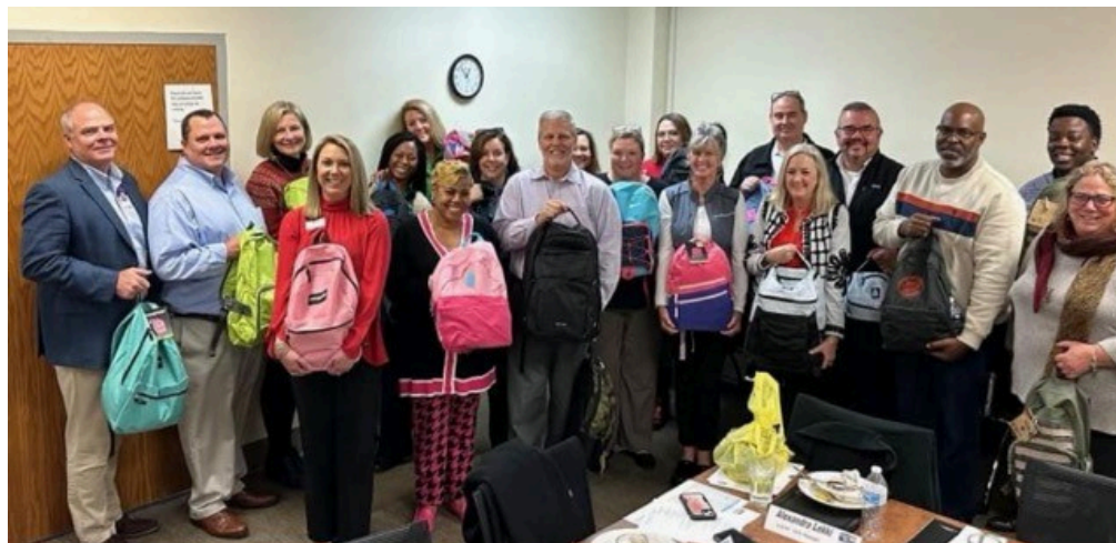
AAUW Board of Directors in action! Final Board Meeting of 2023